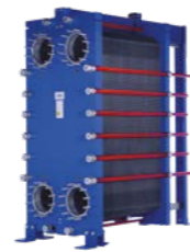
Gasketed plate heat exchangers