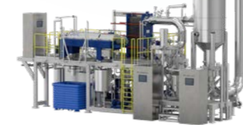
Zero liquid discharge systems