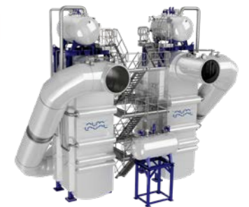
Aalborg waste heat boilers