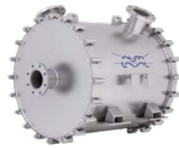
Spiral heat exchangers