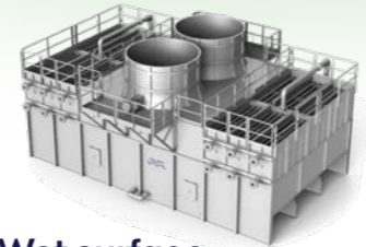
Wet surface air coolers