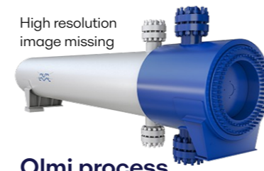
Olmi process shell-and-tube heat exchangers