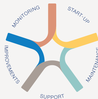
Alfa Laval 360° Service Portfolio